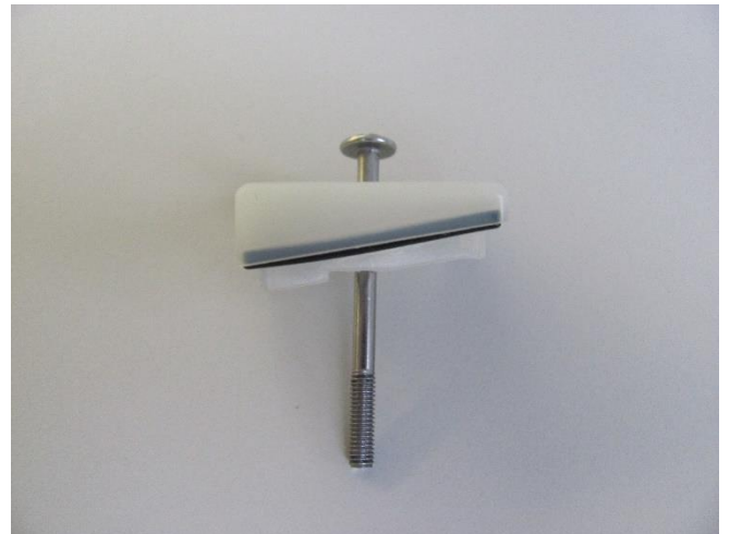
2. Pushing the screw through the cover