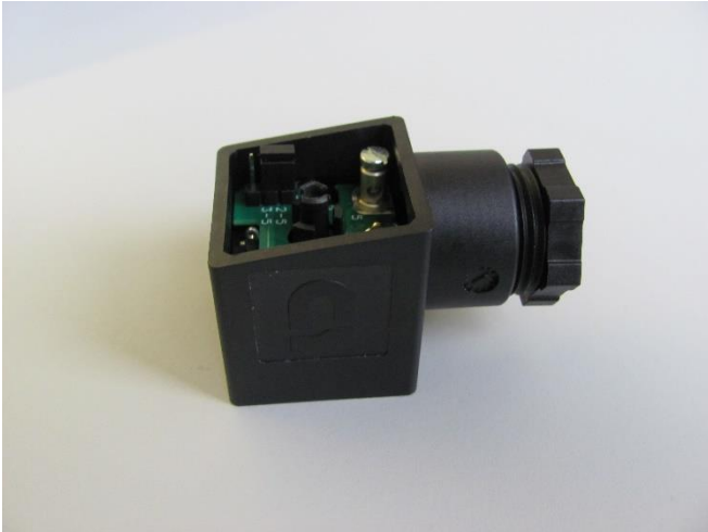
1. Putting the terminal block in the housing